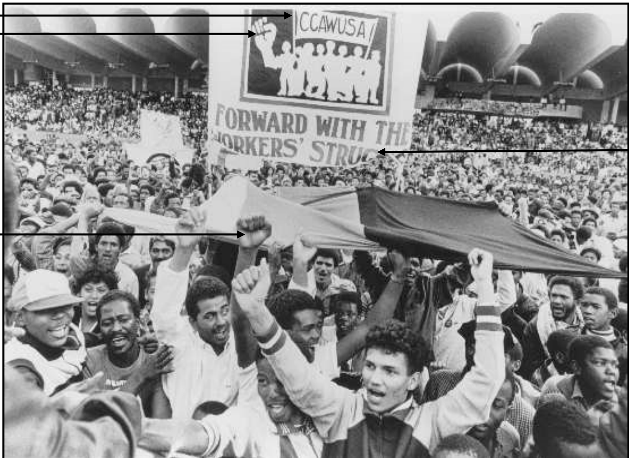
[From History of Trade Unionism in South Africa by L. Gentle, et al.]

The photograph below was taken during a rally organised by the Congress of South African Trade Unions (COSATU) in the Western Cape on 1 May 1986. It shows workers participating in a protest under the banner of the Commercial, Catering and Allied Workers Union of South Africa (CCAWUSA), which was an affiliate of COSATU.