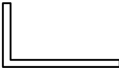
UNEQUAL ANGLE IRON ✓